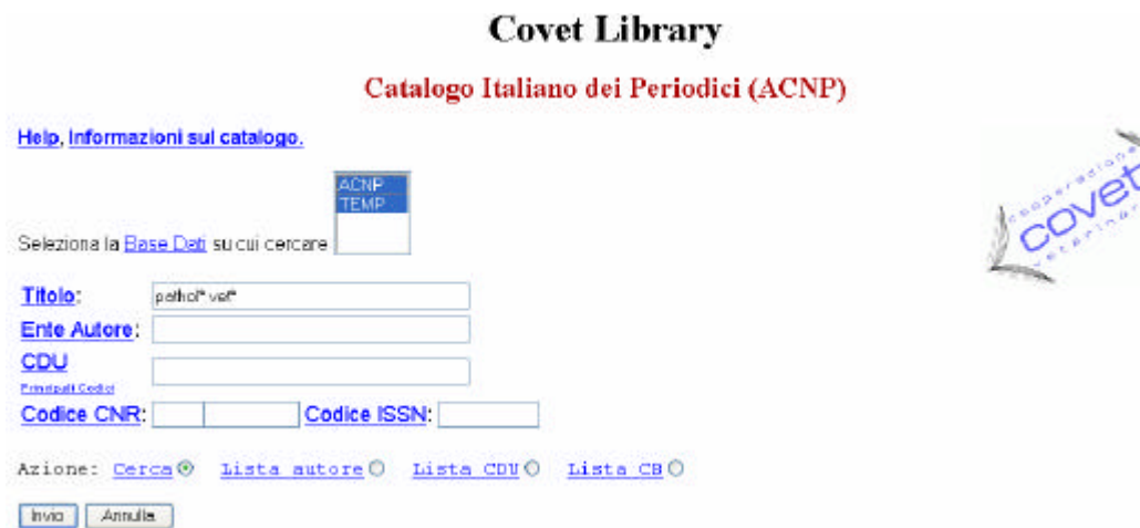
Figure 9: Veterinary union catalogue