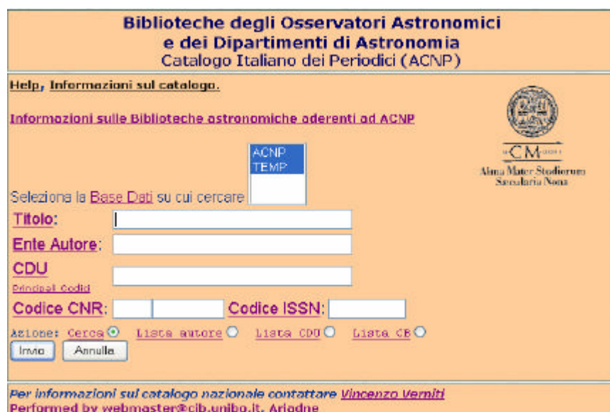
Figure 10: Astronomy union catalogue